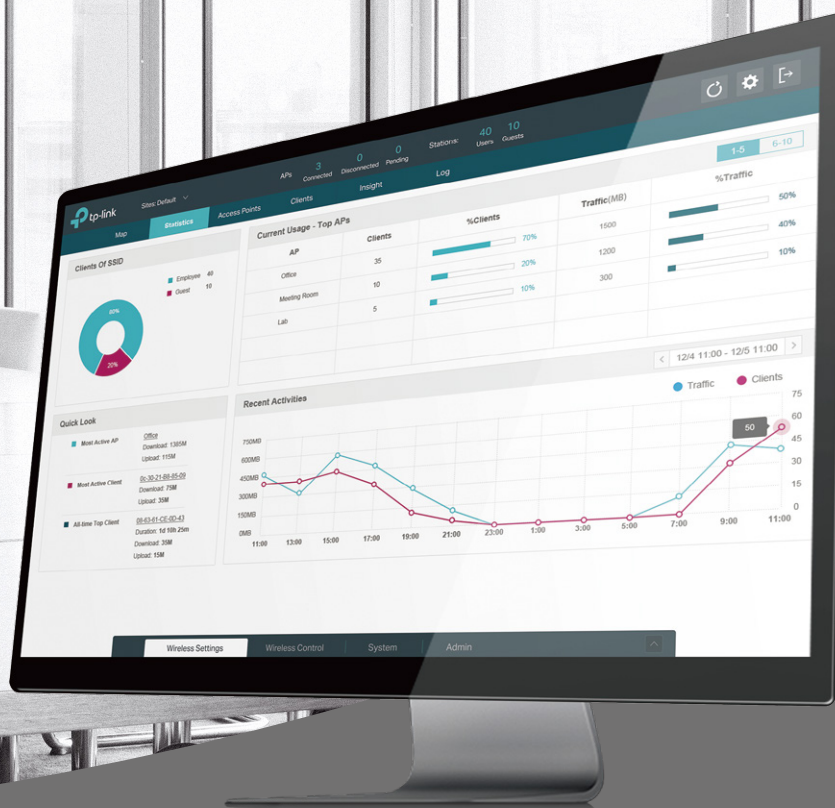
Omada Software Controller

EAP115/EAP110/EAP110-Outdoor/EAP115-Wall/EAP225-Wall