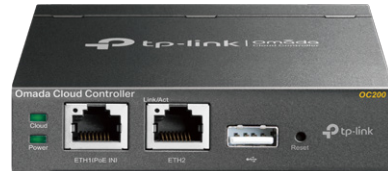
Omada Cloud Controller—OC200 (Built in Software Controller)