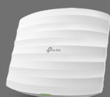
EAP330/EAP320 EAP245 V3/EAP225 V3 EAP115/EAP110